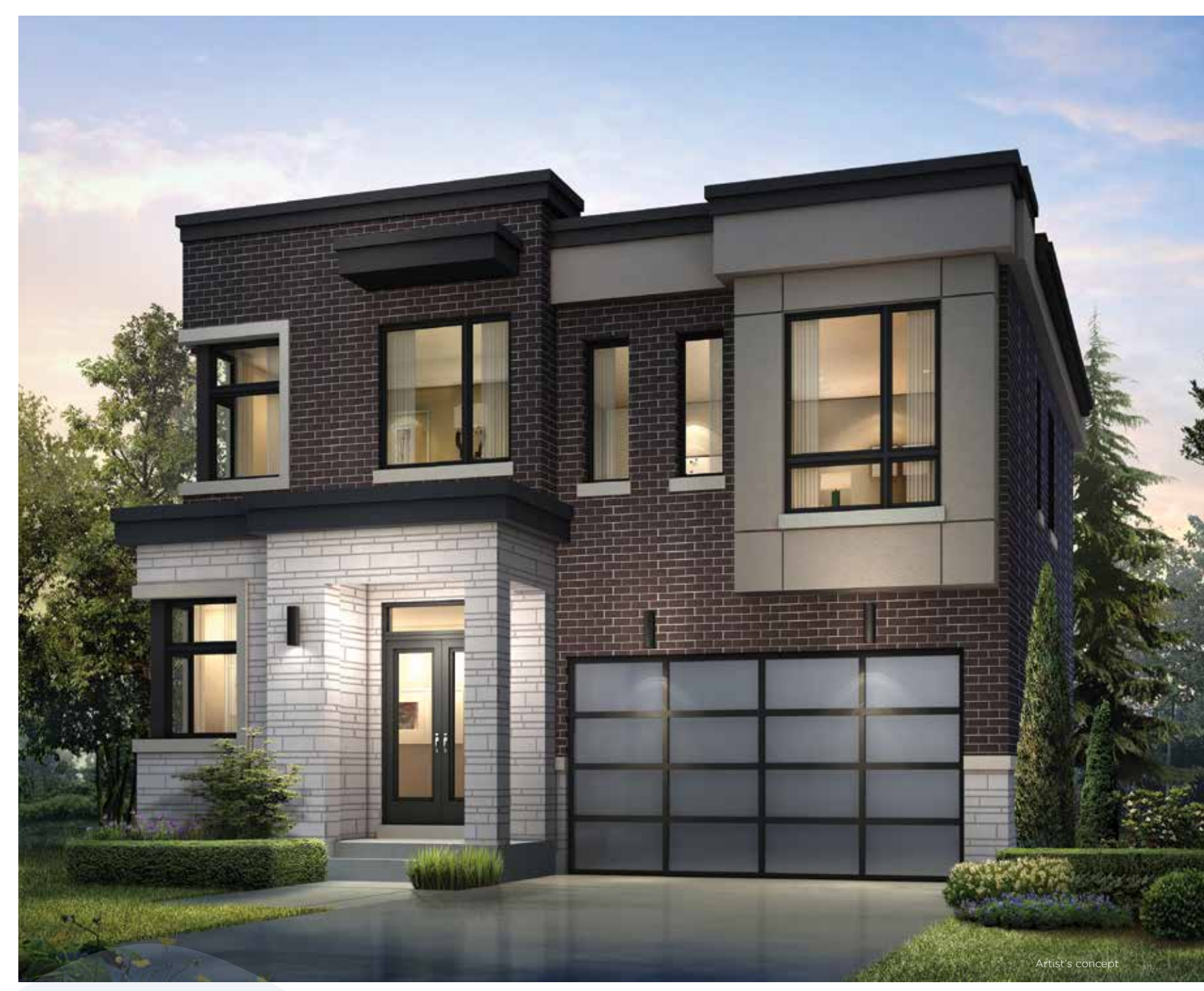
THE WHARF ELEVATION C - 2,692 SQ.FT.