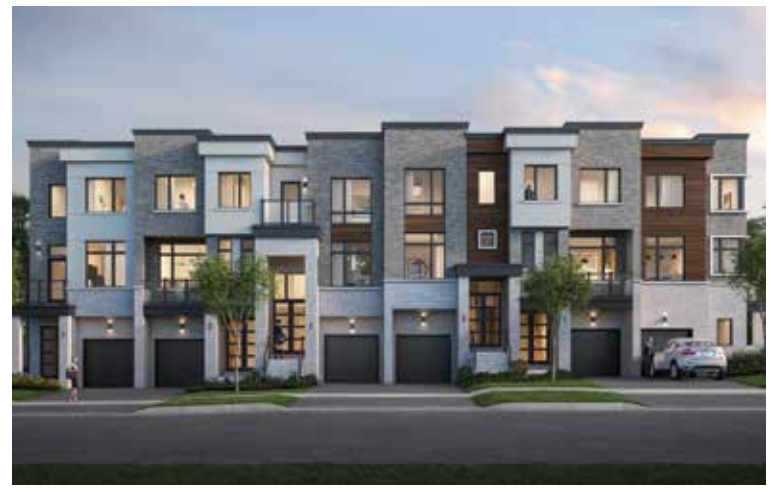
ZIGG , TORONTO